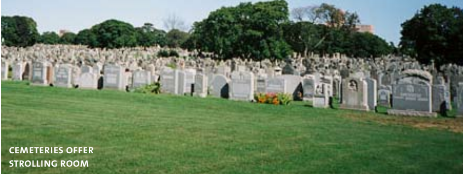
CEMETERIES OFFER STROLLING ROOM