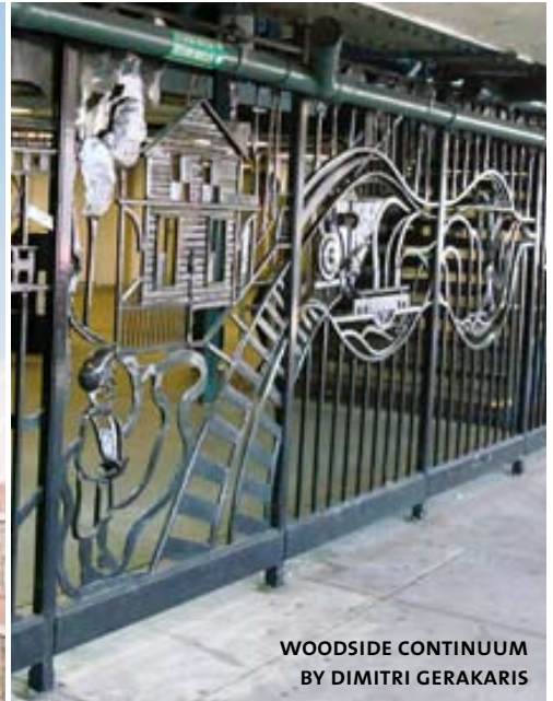
WOODSIDE CONTINUUM BY DIMITRI GERAKARIS