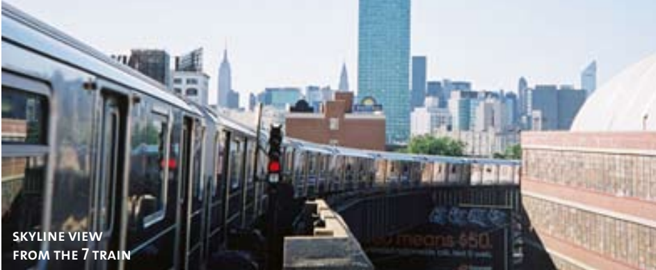
SKYLINE VIEW FROM THE 7 TRAIN