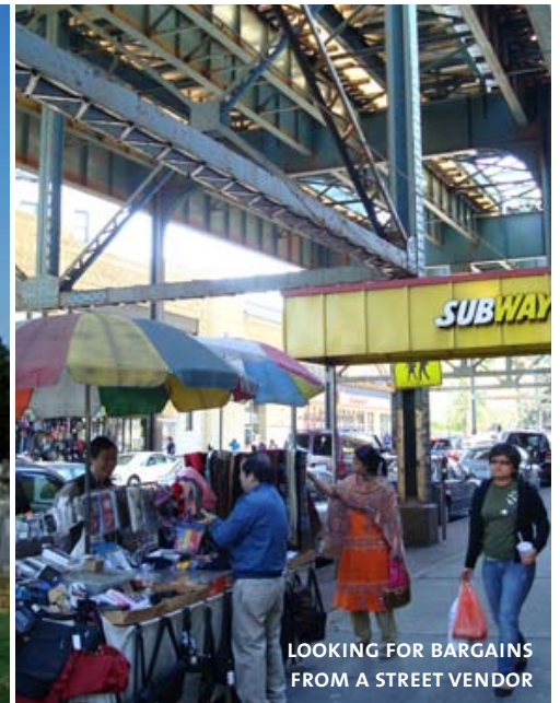
LOOKING FOR BARGAINS FROM A STREET VENDOR