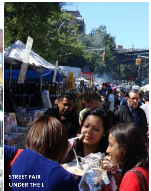
STREET FAIR UNDER THE L