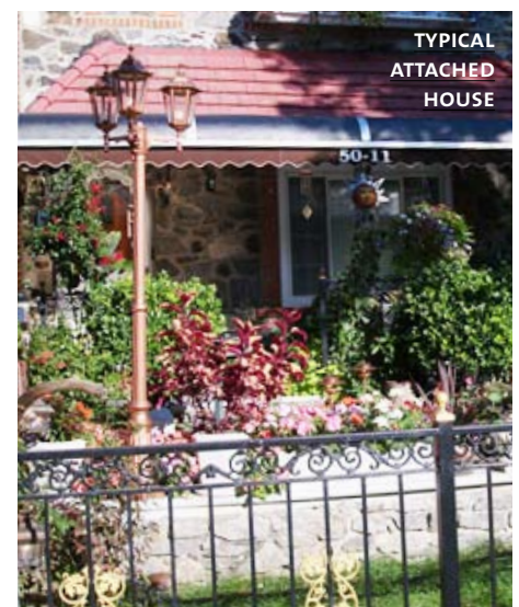
TYPICAL ATTACHED HOUSE