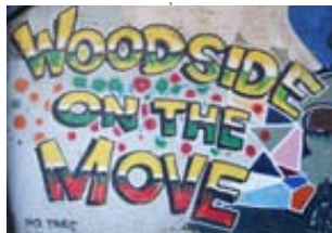
GREETER'S SECRET: The 7 train was named a National Millennium Trail in 2000 by then First Lady Hillary Rodham Clinton.

1 Getting to Woodside is half the fun! For a real New York experience, take the 7 train from Grand Central Station or Times Square to Woodside.