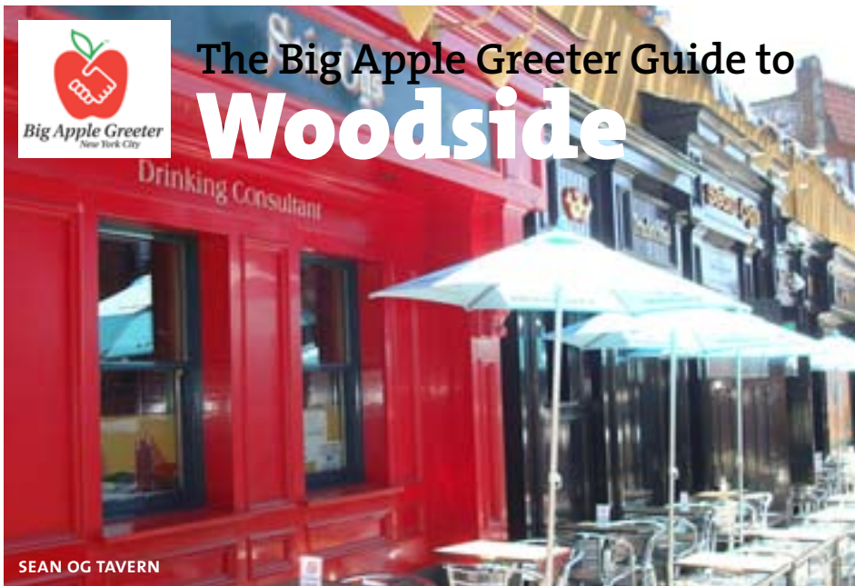
SEAN OG TAVERN