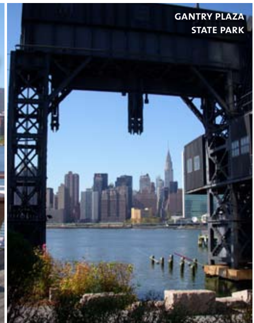
GANTRY PLAZA STATE PARK