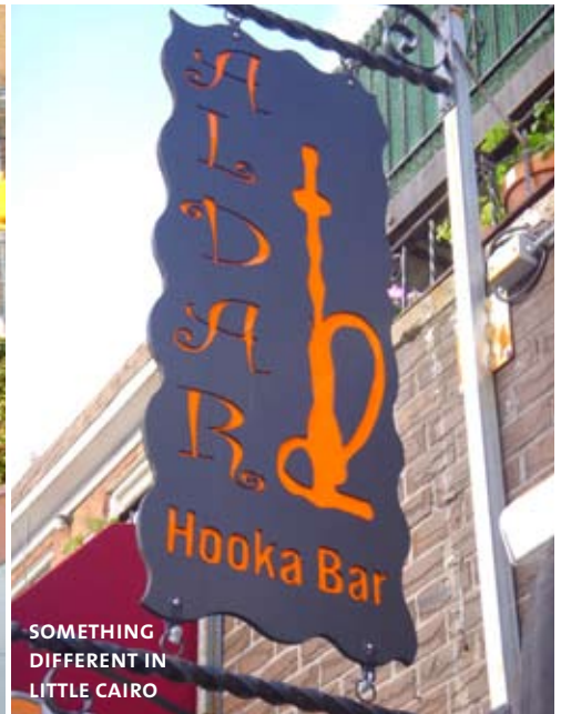
DRINK IN THE ATMOSPHERE WHILE DINING OUTDOORS