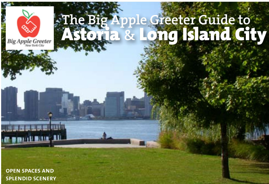
OPEN SPACES AND SPLENDID SCENERY