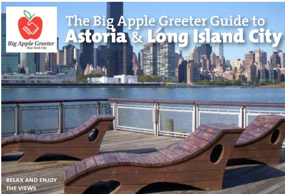
RELAX AND ENJOY THE VIEWS