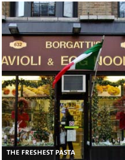
THE FRESHEST PASTA

The Belmont area of the Bronx was once part of the vast estate held by the Lorillard family who built the first tobacco company in New York in 1760. Feeling the Bronx was better suited for a large manufacturing plant, the family purchased a large tract of land in 1792 near the Bronx River where they built a mansion and a highly