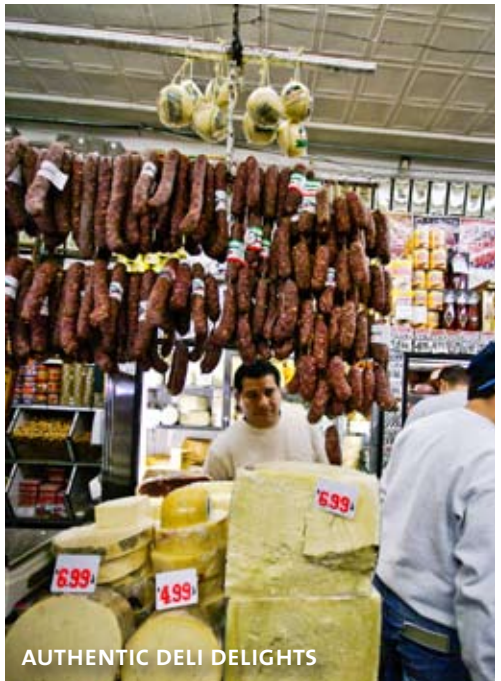
AUTHENTIC DELI DELIGHTS