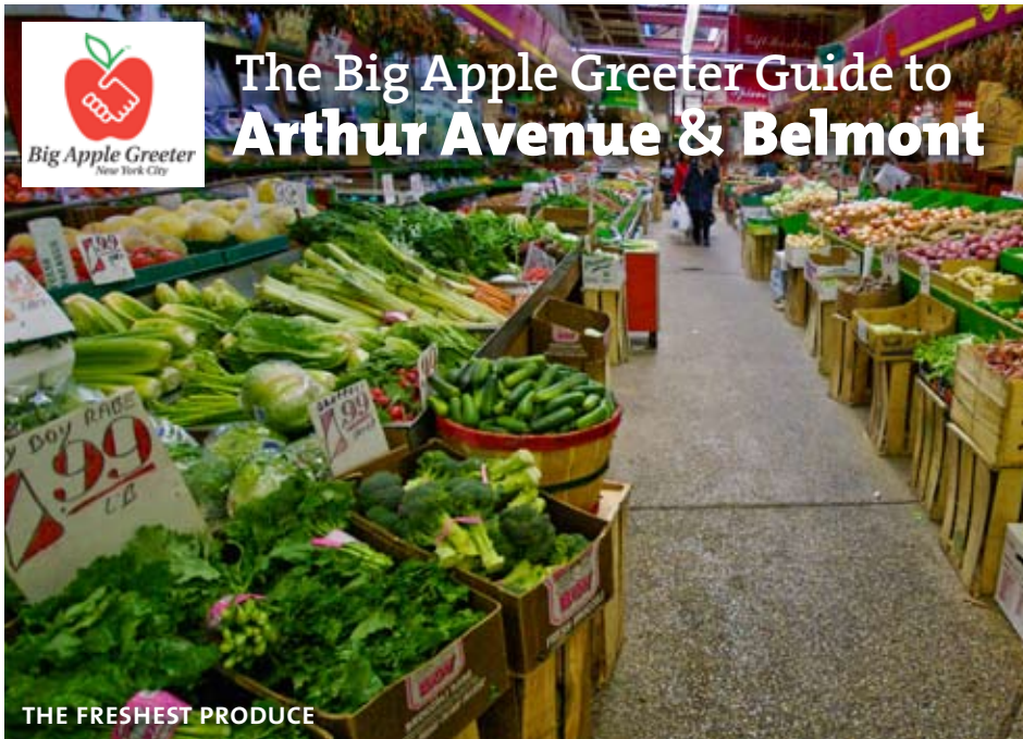
THE FRESHEST PRODUCE